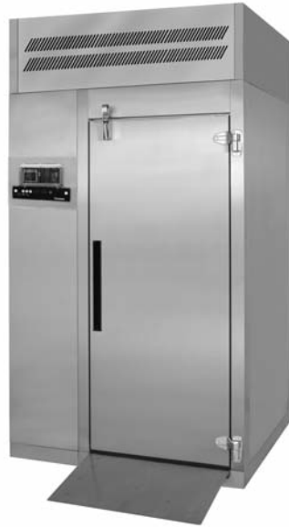
Model shown with optional insulated floor and ramp.